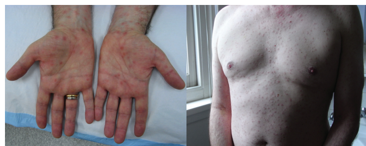
Rashes indicating Infectious Syphilis

Our role and responsibility in managing infectious syphilis also includes helping any sexual partners to get treatment. Infectious syphilis is a very important STI for contact tracing. Most patients will be able to notify recent partners themselves, but they often need some help. Firstly, a contact of infectious syphilis should be tested and also presumptively treated for syphilis (without awaiting the results of tests). The index person should be informed of this. Secondly, a patient may be quite anxious about contacting a sexual partner for a variety of reasons. Often, patients will prefer to make such contact anonymously.